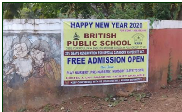
Publicity of for admission