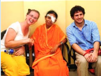
Volunteers from Unite For Sight, a USA-based NGO, sharing some moments with a cataract surgery patient at Kalinga Eye Hospital

84 people affected with Diabetes were treated with Laser Photocoagulation procedure, preserving their sight.