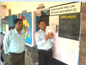
Teachers trained for eye screening of school children are being validated by the technical staff of Kalinga Eye Hospital, Dhenkanal.

84 people affected with Diabetes were treated with Laser Photocoagulation procedure, preserving their sight.